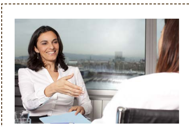
Accept a job