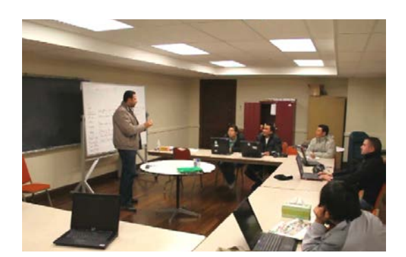
Attend orientation sessions