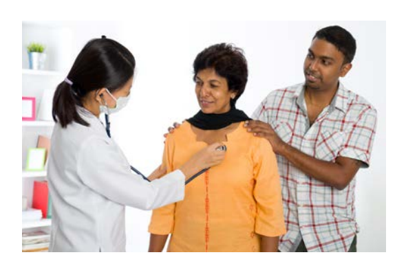
Attend doctor's appointments