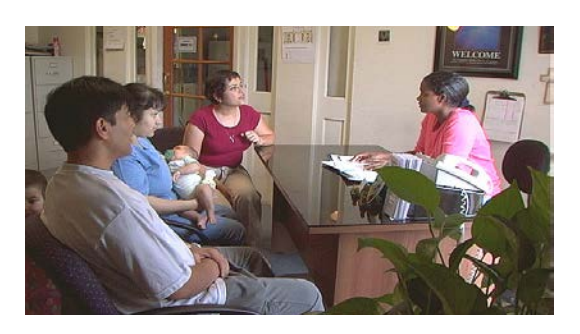
Role of the Local Resettlement Agency