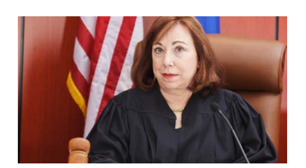
U.S. Laws and Refugee Status