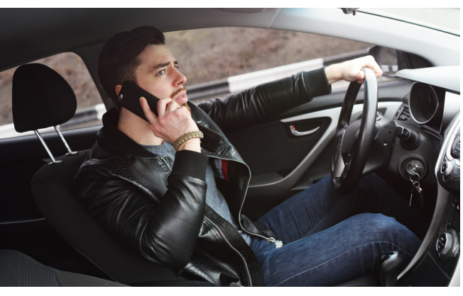
Using the cell phone while driving