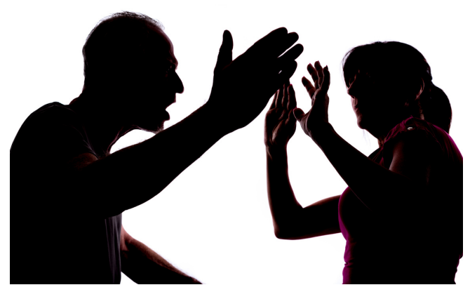
Physical abuse of partner