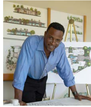
To start on the path to a higher paying job.