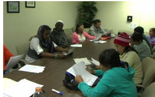
To learn and practice English.