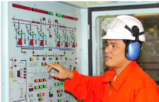
To use my skills.