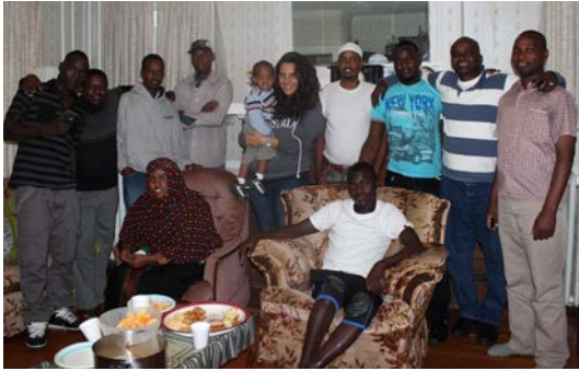
To get to know my community and the people in it better.