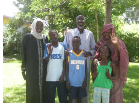
To support my family.