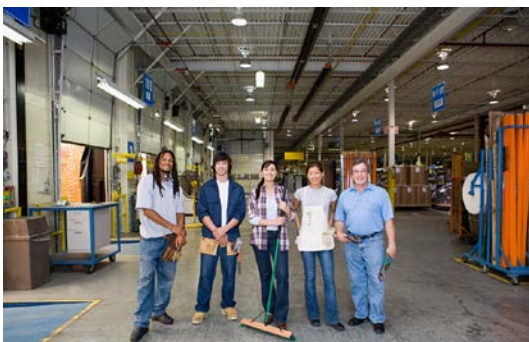
To learn more about U.S. culture.