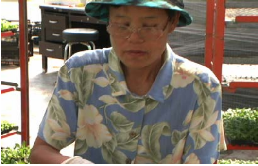
To stay busy.