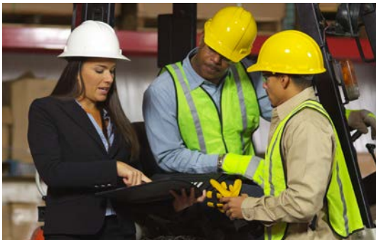
To interact with Americans.