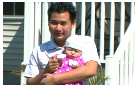
To set a good example for my children.